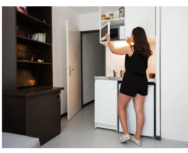
145 Avenue Berthelot 69007 Lyon